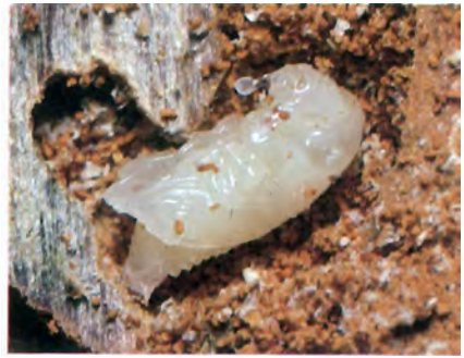
Figure 6—Pupa of California fivespined ips .

Late summer or fall attacks produce a partial generation that overwinters under the bark of trees or slash as mature larvae, pupae, or adults (fig. 7).