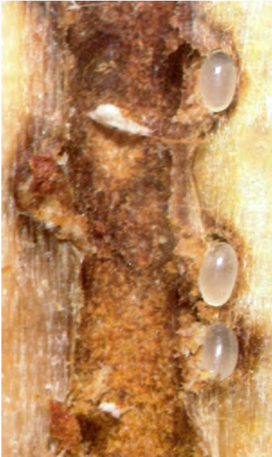
Figure 4 —Eggs in niches along a gallery.

to five spring/summer generations in addition to the overwintering one. Seasonal variations in temperature can also cause one generation more or less than average for a locality.