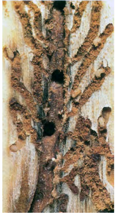
Figure 5 —Larvae in mines radiating from an egg gallery.