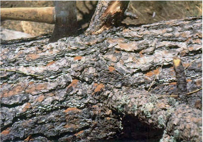
Figure 2 —Boring dust on slash.

It attacks the following native pines: ponderosa, sugar, Coulter, western white, lodgepole, Jeffrey, Digger, knobcone, Monterey, and bishop pines. It also attacks knobcone X Monterey hybrid pines and probably other pines introduced in-