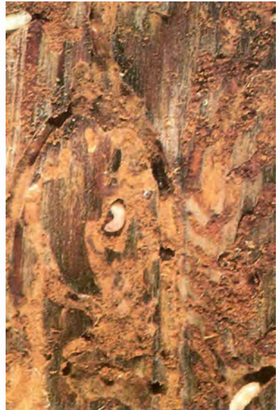
Figure 7—Under the bark: larvae, pupae, and adults in a Y-shaped egg gallery.