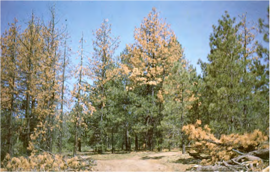
Figure 8 — Ponderosa pine killed by California five-spined ips population that built up in the slash piles in the foreground.